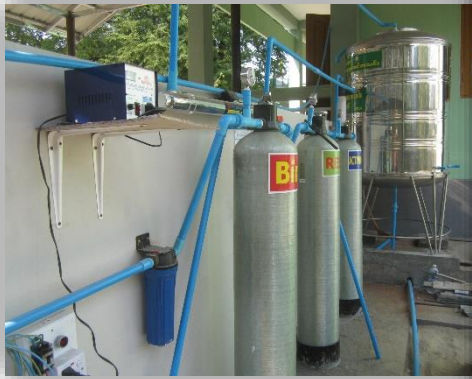
The water purifying system

students to make the best out of the opportunity to learn – not taking it for granted! At the end of the ceremony, each student got 2 plums (a real treat for them!), note books, and pens.