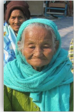
The 7th anniversary celebration of the Metta Clinic. A snack before the ceremony starts (below left)