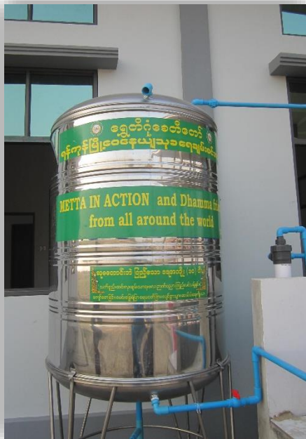
The water tank, part of the water purifying system (left)