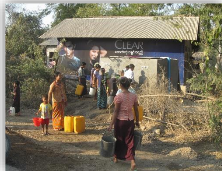
Two of the water stations in Thaleba