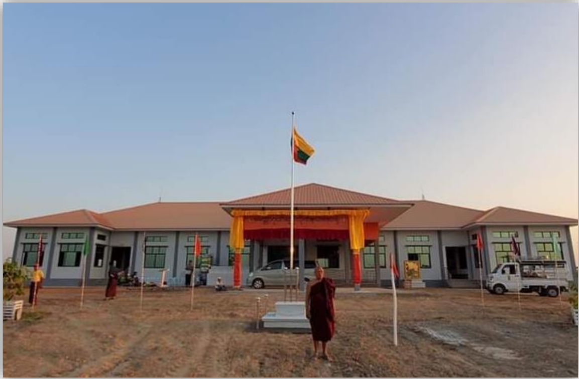
Sayadaw U Indaka in front of the Metta Cottage Hospital in Thaleba

The annual visit to Thaleba on the 6 th of February was dominated by one event: The Metta Cottage Hospital . However, as usual we supported other projects such as offering a new water purifying system for the school, solar panels to run the water pump for the distribution of the water in the village, and medical support for the elders. In the village across the River Mu, we offered some funds to buy medicines for the local clinic in Kyaugone.