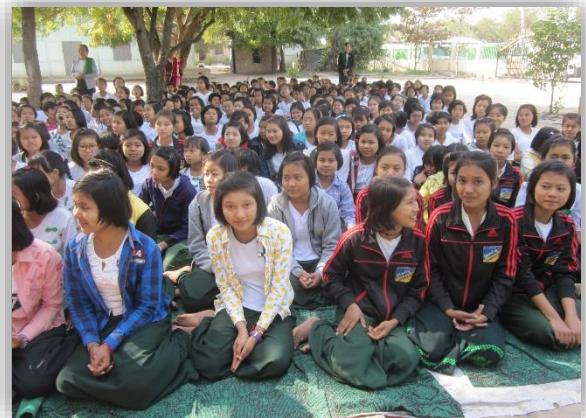
... and the girls sitting on the other side