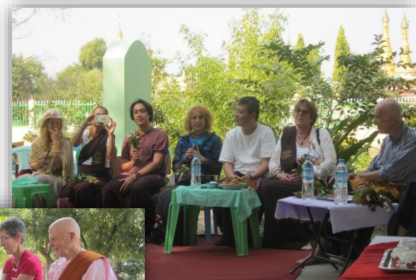
The foreign yogis watch and enjoy the ceremony