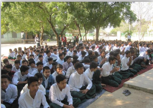
The boys sitting on one side of the school yard ...