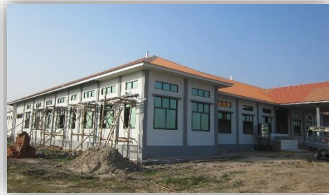
The hospital before completion (right)