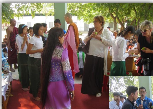
Distribution of plums, pens, and note books