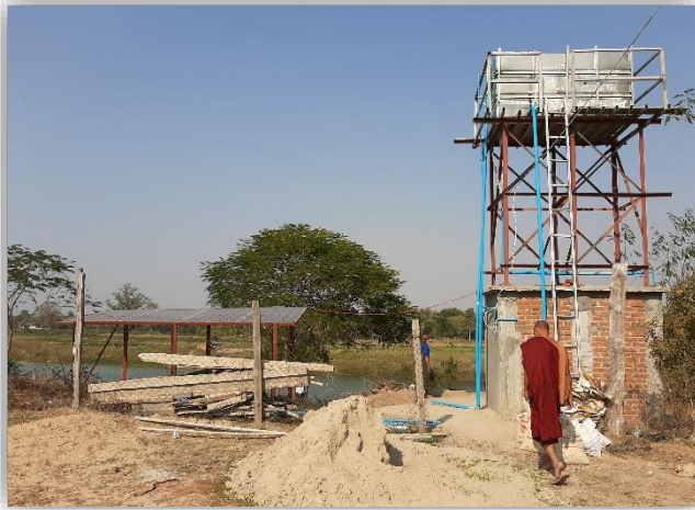
The solar panels (left) and the water tower (right)