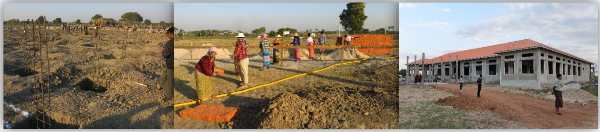
The construction of the Thaleba Cottage Hospital took just a bit more than one year

On the 1 st of March 2020, the Thaleba Cottage Hospital was officially handed over to the government which will provide the necessary equipment and staff (doctors, nurses, assistants) and is now responsible to run the hospital. This was a big day for the people in Thaleba and 11 neighbouring villages: now they have an even better medical facility very close by! For both patients and family members there is no more need to travel far to the next hospital. Last year Metta In Action had donated a large sum of money towards the construction of the hospital, part of that money was used for the water purifying system (see next page).