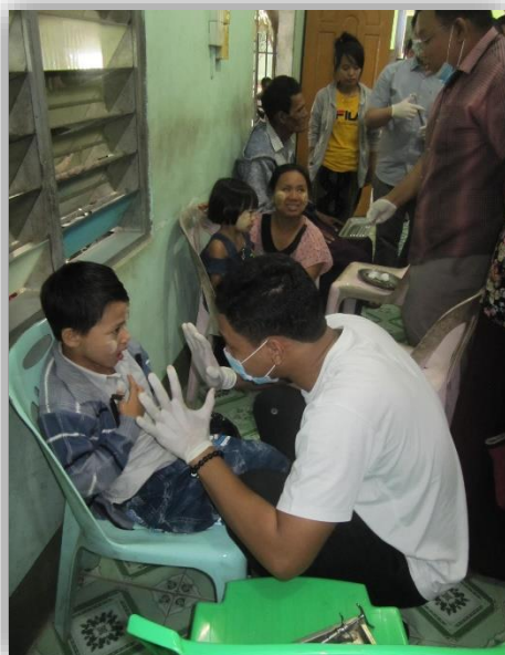
A dentist explains the little boy what he is going to do (left)