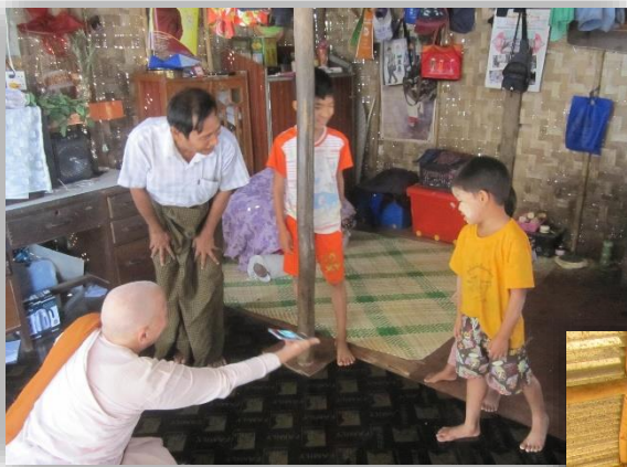
Her husband, daughter, and three grand kids