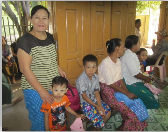
Patients in the waiting area

The Aye Metta Ayu Dana Clinic , in short the Metta Clinic , is a necessity valued by so many people who come from near and far. Many of these people cannot afford to see a doctor or a dentist, having no other option than to live with the pain, the ulcer, the sickness, the tooth ache, or to face death. Since the establishment of the free clinic on the premises of CMMC twelve years ago, thousands of patients have received treatment and recovered from their disease or become free from pain.