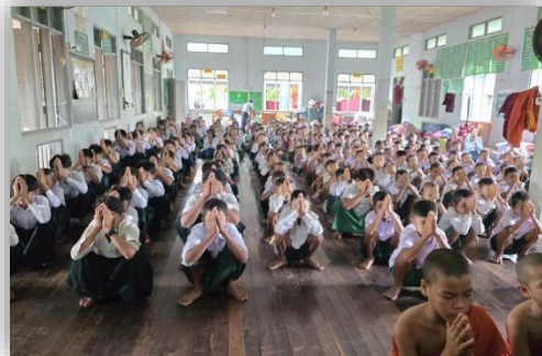
The students of the Aung Yatanar Shwe Oh School