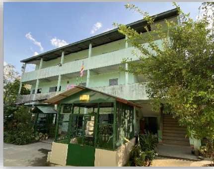
The roof to this building needs to be repaired

The large, beautiful bouquets of flowers in the room were from Daw Aye Singhi's birthday celebration the day before. She turned 63 and, after a period of some serious health issues, is now in good health again.