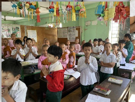
In the classrooms