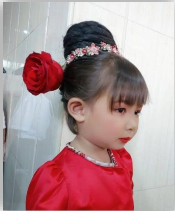
A young student Receiving an award A traditional dance The parents watching the performances

At the end of the school year in March, she organizes an event for the parents with songs, dances, and the distribution of awards for the kids. Unfortunately, we had left for Upper Burma and could not join the festivities. However, she did send us some photos.