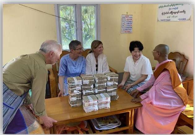
It is a joy to offer such a pile of dāna!