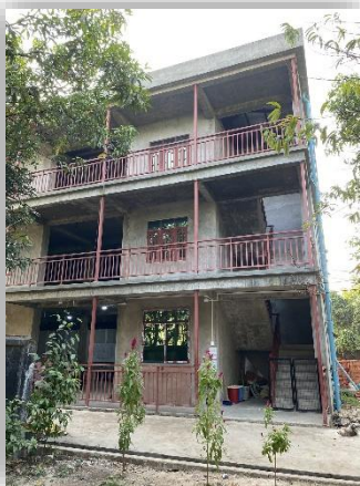
The new building

This is a new monastic school on the grounds of the Saranagonyee Nunnery. A retired teacher, now a nun, set up the school, for nuns only. In its first year, 100 students, all nuns, attend the school, taught by 10 teachers. Some of the teachers are retired, and four of them live at the nunnery. They teach from KG through 11 th grade. To be recognized by the government, she needs to work together with another monastic school open to girls and boys. Therefore, the students need to go to the other school for their exams.