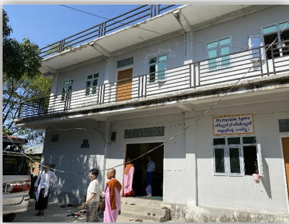
The new building