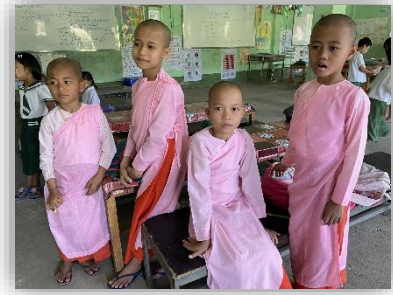
Nuns in their classroom

We noticed several similar-looking bicycles in front of the school. Apparently, a Burmese donor offered ten bicycles to be used by teachers and students who live further away.